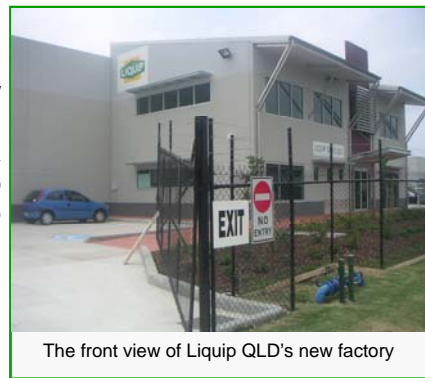
The front view of Liquip QLD's new factory

On December 16 th 2005, Liquip Queensland officially opened their new facilities. This additional expansion comes as a much needed remedy to the thriving growth Liquip Queensland has been experiencing.