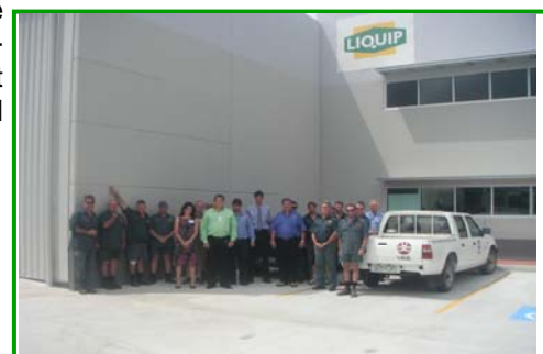
The Liquip QLD team assembly in front of the new factory on opening day

This upgrade of facilities provides Liquip Queensland with significant advantages and offers the essential resources needed for future growth. It furthermore ensures that the business will continue to thrive.