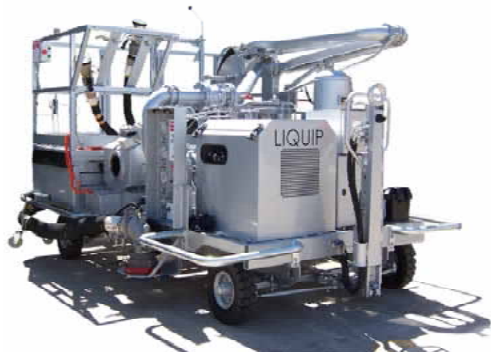
Photo: The new LIQUIP B747 Cart

This was a great achievement for Liquip with just a two month delivery demanded by the client. The initial reaction when first presented with the order and commitment to deadlines was: "that's a big ask". All departments and staff members dedicated many hours to build these units under such tight restraints. This was a great achievement by all.